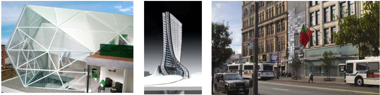
Left: Penthouse für Diane Von Furstenberg Headquarters, WORK AC / Center: Metropol Tower, Gage Clemenceau Architects / Right: Harlem Mediatech by G TECTS LLC