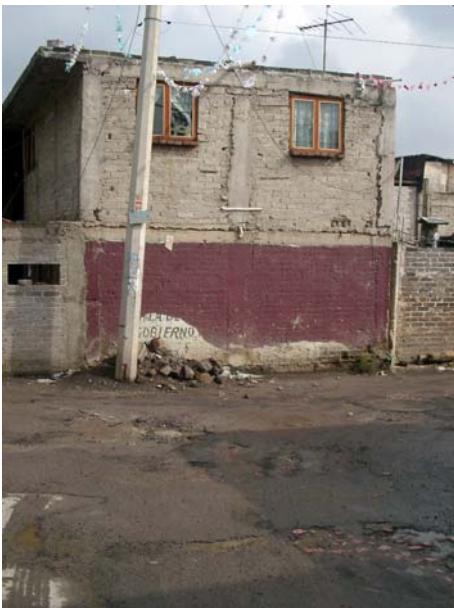
photo: Livia Corona (winner of Sony World Photography Awards 2008, category architecture)

View over one of the multitudinous residential developments in the suburbs of Mexico City.