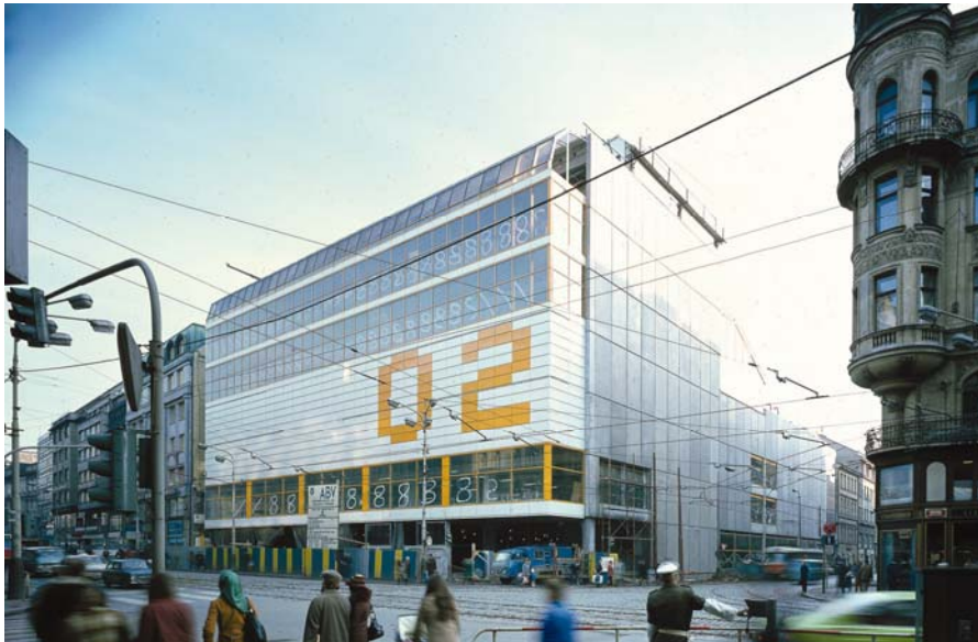
Máj Departement Store, Prague