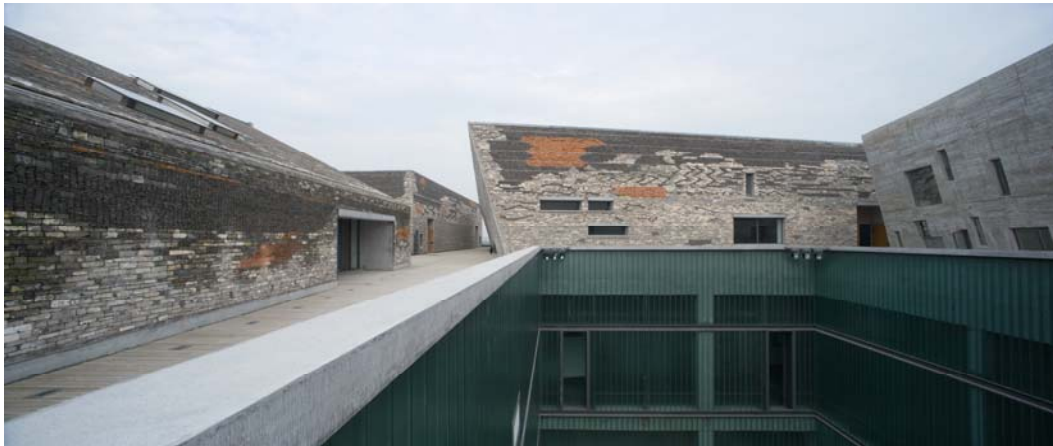
Ningbo History Museum, Amateur Architecture Studio.