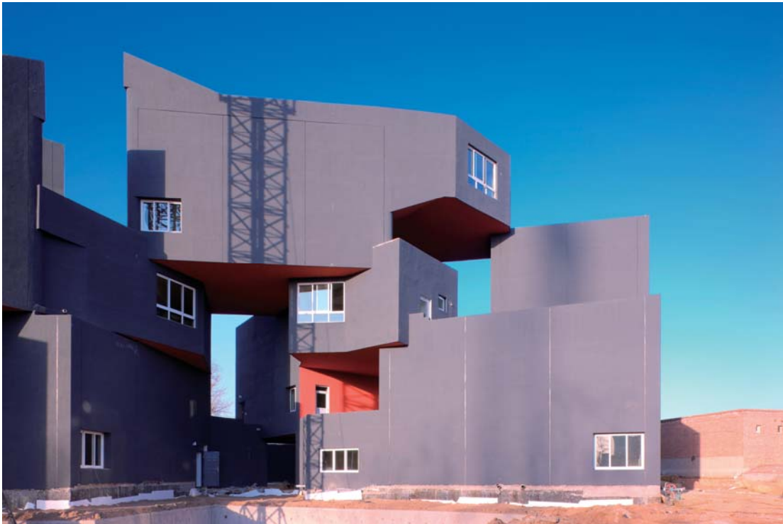
Songzhuang Artists' Residence, DnA_Design and Architecture.

Berlin, November 2009. M8 IN CHINA explores new trends in contemporary Chinese architecture. The exhibition is dedicated to showcasing small, flexible and independent firms in China which want to mediate between modernity and Chinese architectural tradition.